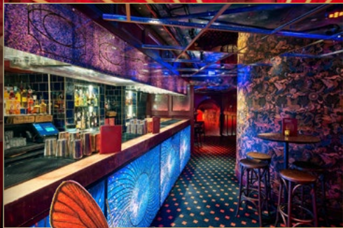
The Grand Hall: 40 Standing