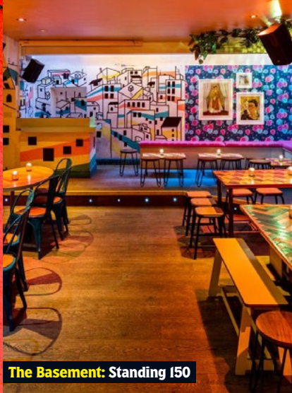
The Basement: Standing 150