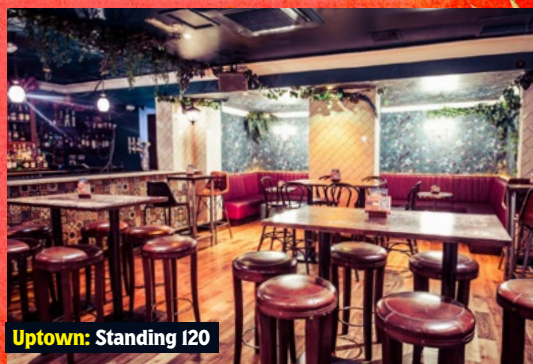
Uptown: Standing 120