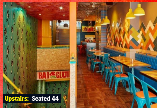
Upstairs: Seated 44