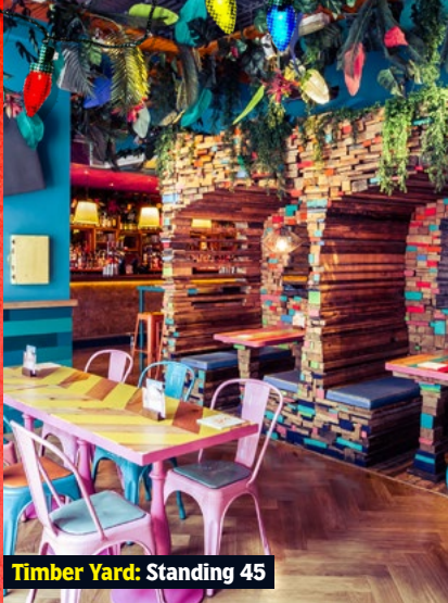
Timber Yard: Standing 45

Scan this QR code to find out more about this venue