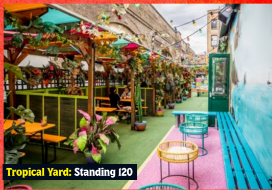
Tropical Yard: Standing 120