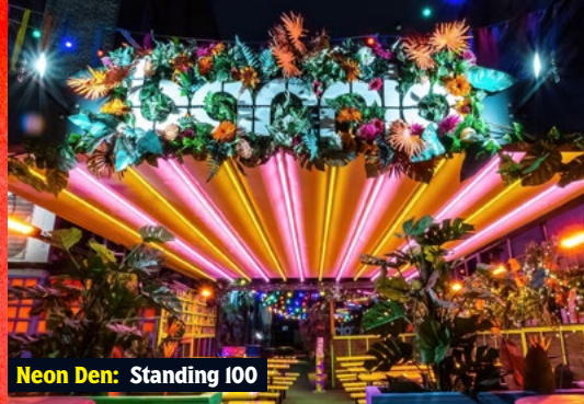
Neon Den: Standing 100