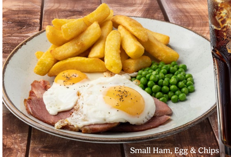
Small Ham, Egg & Chips