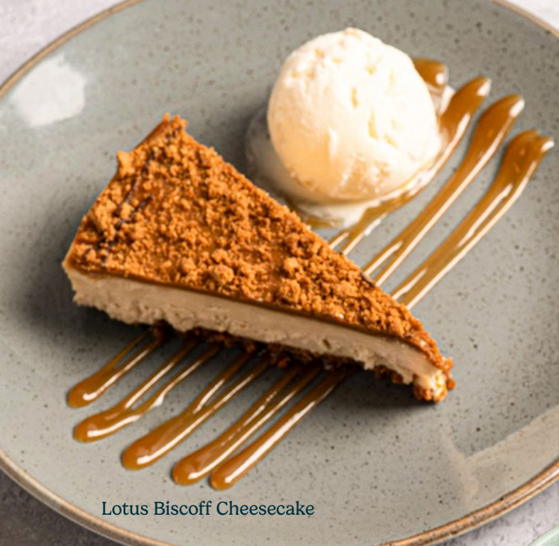
Lotus Biscoff Cheesecake