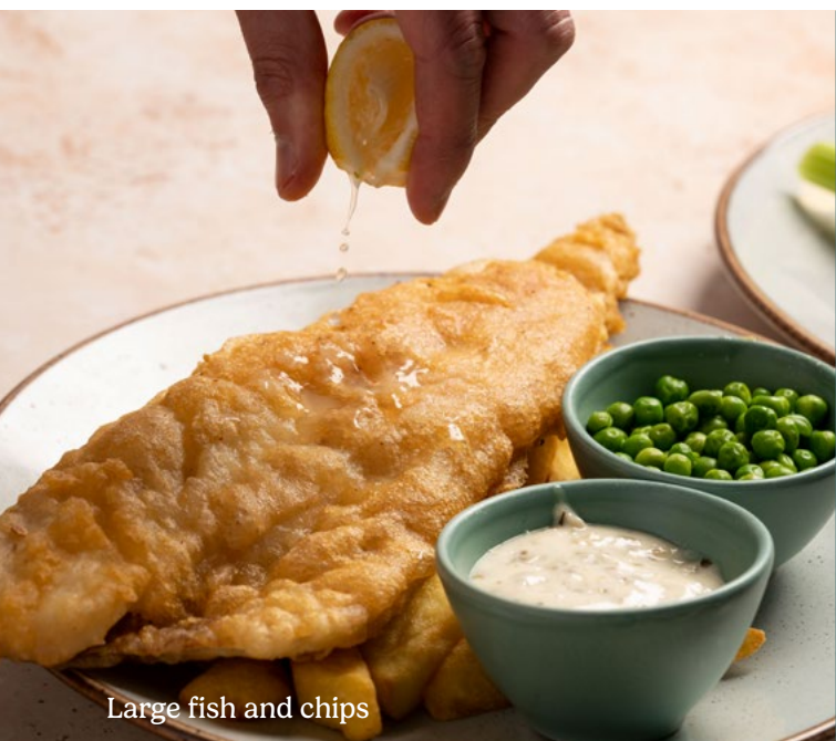
Large fish and chips