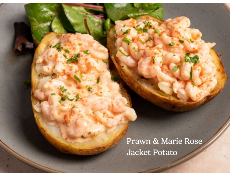
Prawn & Marie Rose Jacket Potato