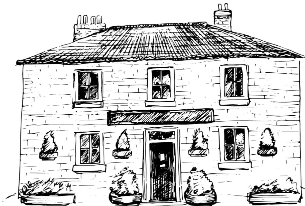
THE DAM INN